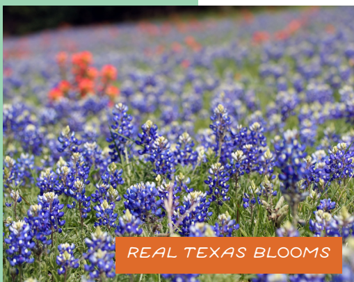
REAL TEXAS BLOOMS