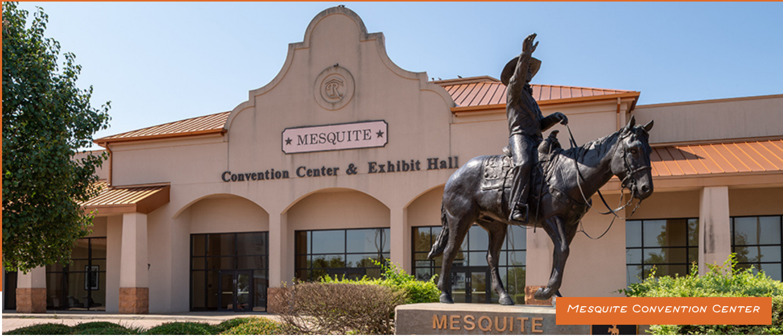
MESQUITE CONVENTION CENTER