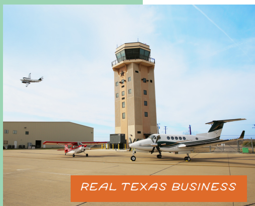
REAL TEXAS BUSINESS