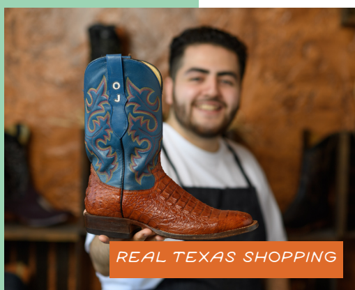
REAL TEXAS SHOPPING