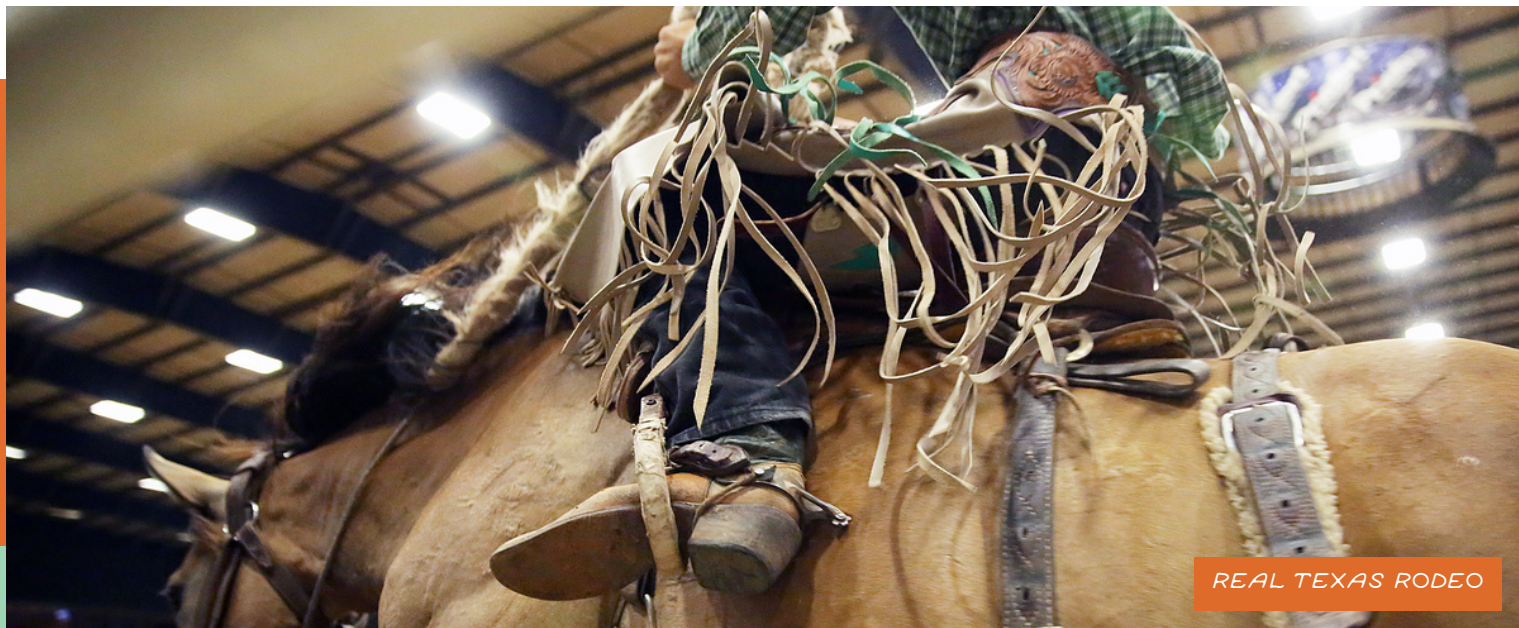
REAL TEXAS RODEO